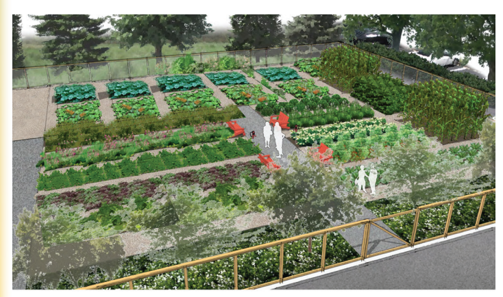
God's Garden Design

Did you know that the Foundation does not direct what its revenue is used for? Some donors have designated their gifts toward particular ministries and the Foundation lets the Session know which of those funds need to be used in those ways. Some examples of designated revenue in 2017 include about $35K for missions. Of that money, our Session designated $15K toward the God's Garden project that we are excitedly building in our north parking lot to create about 20 garden plots for refugee families. About $35K is designated for buildings and grounds and our Session uses that money to maintain and improve our building. About $10K is designated to support Westminster's Fine Arts program. About $6.5K is